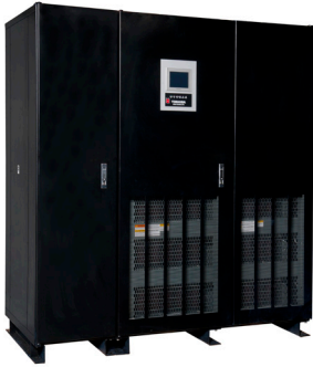
G9000 Enhanced Series